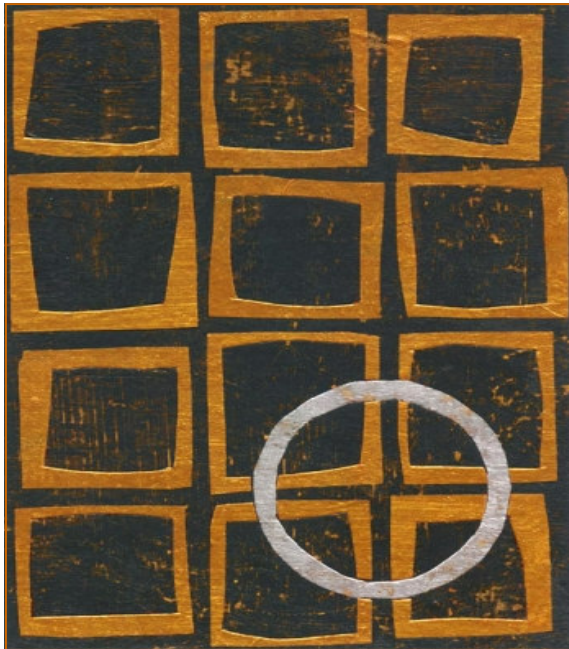
“FINDING THE FOCUS”

Rectory Office Hours: Monday—Friday 9:00 a.m. to 5:00 p.m.