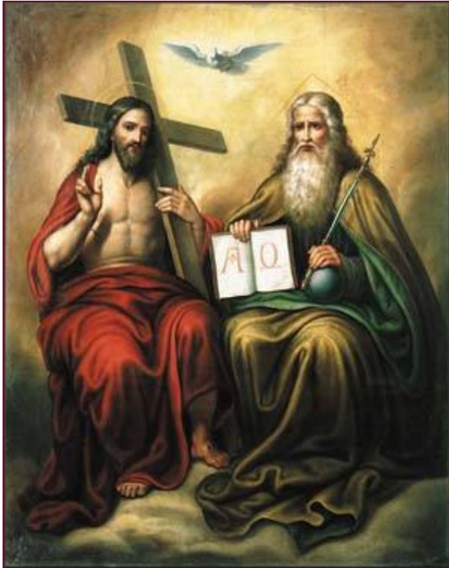
The Most Holy Trinity

Rectory Office Hours: Monday—Friday 9:00 a.m. to 5:00 p.m.