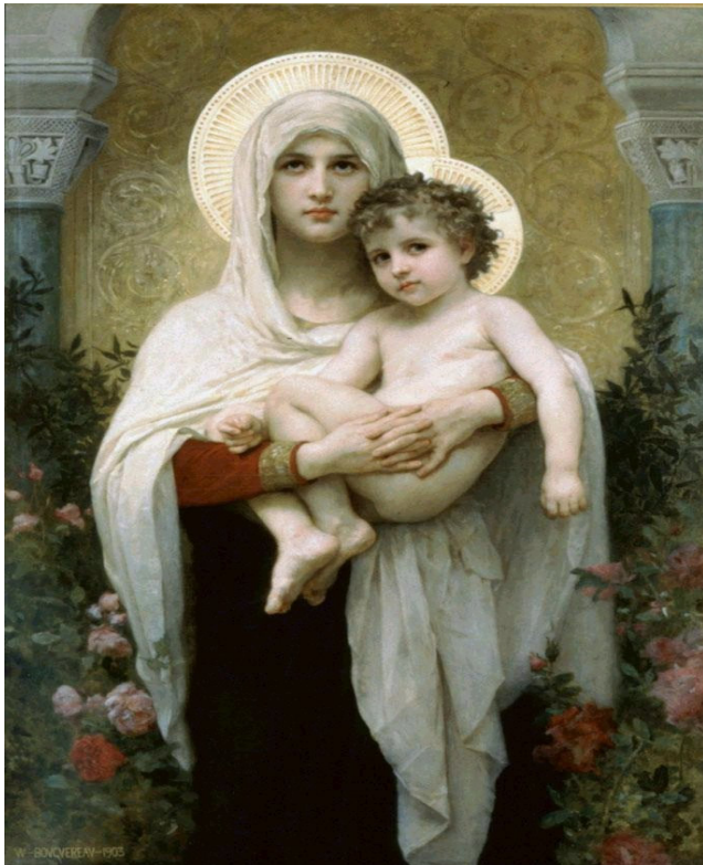
Mater Dolorosa Church