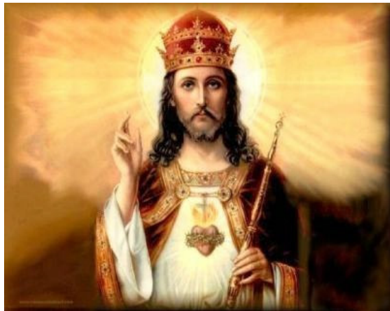
OUR LORD CHRIST THE KING SUNDAY