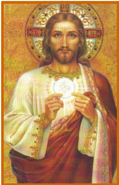
THE BODY & BLOOD OF CHRIST

Monday—Friday 9:00 a.m. to 12:00 p.m. 1:00 p.m. to 5:00 p.m.