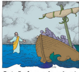
It is I; do not be afraid. © J. S. Paluch Co., Inc.

As for Peter and the apostles, they discover the presence of God after the storm at sea. They and the sea and the winds are stunned into silent reverence. Copyright © J. S. Paluch Co.