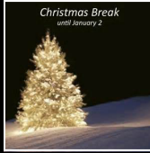
Christmas Break until January 2

Our CFF and Rectory Offices will be closed until January 2, 2015. Telephone messages will be checked periodically.