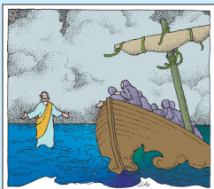
It is I; do not be afraid.

Gospel, as Jesus makes his disciples get into a boat without him and goes off alone while they venture into stormy waters. Of course, neither Jews nor Christians believe that the Almighty plays this sort of whimsical game with them, but there is some truth in the statement that we don't turn to God for saving help until we're in a bind. Peter's role today, as it is throughout the New Testament, is to be a sign or to represent each member of the church and the whole church. Our story is the tale told about Peter's faith today. What can bolster our faith is that even when Christ calls us to face bravely the tempests of life, if we are walking through them with our eyes fixed on him in faith, we have nothing to fear. Even when we falter or sink, simply crying "Lord, save me!" is enough to help us know the steady grasp of God's hand. Then, sheltered inside the walls of faith, the storms we endure lose their power over us.