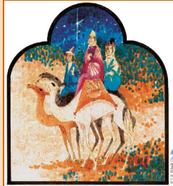
Magi from the east arrived